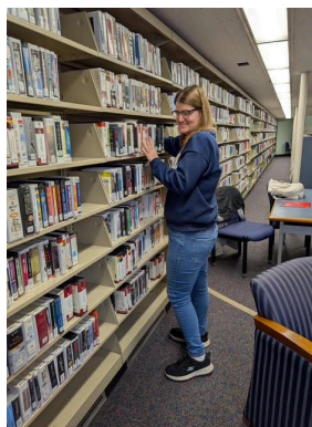
Hazel Park Library